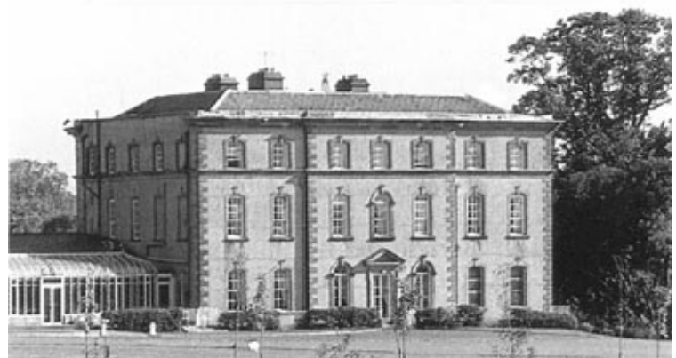
Dundrum House, Dundrum, Co. Tipperary, Ireland