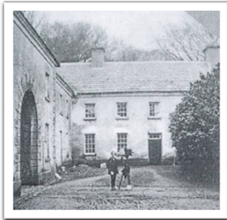
Young man with tripod, Dundrum House, west wing

Photography critics have noted strong Catholic influences in her work, as well as an artistic style which is reminiscent of Dutch baroque paintings.